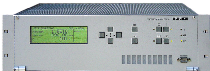
VHF/FM transmitter T 3270

The control unit CU 3254 serves for the transmitter’s operational, control and monitoring functions. It is microprocessor controlled. Operational conditions are indicated by LEDs and an LCD. For remote control, the control unit incorporates a V.24/RS232C interface or optionally a BITBUS interface.